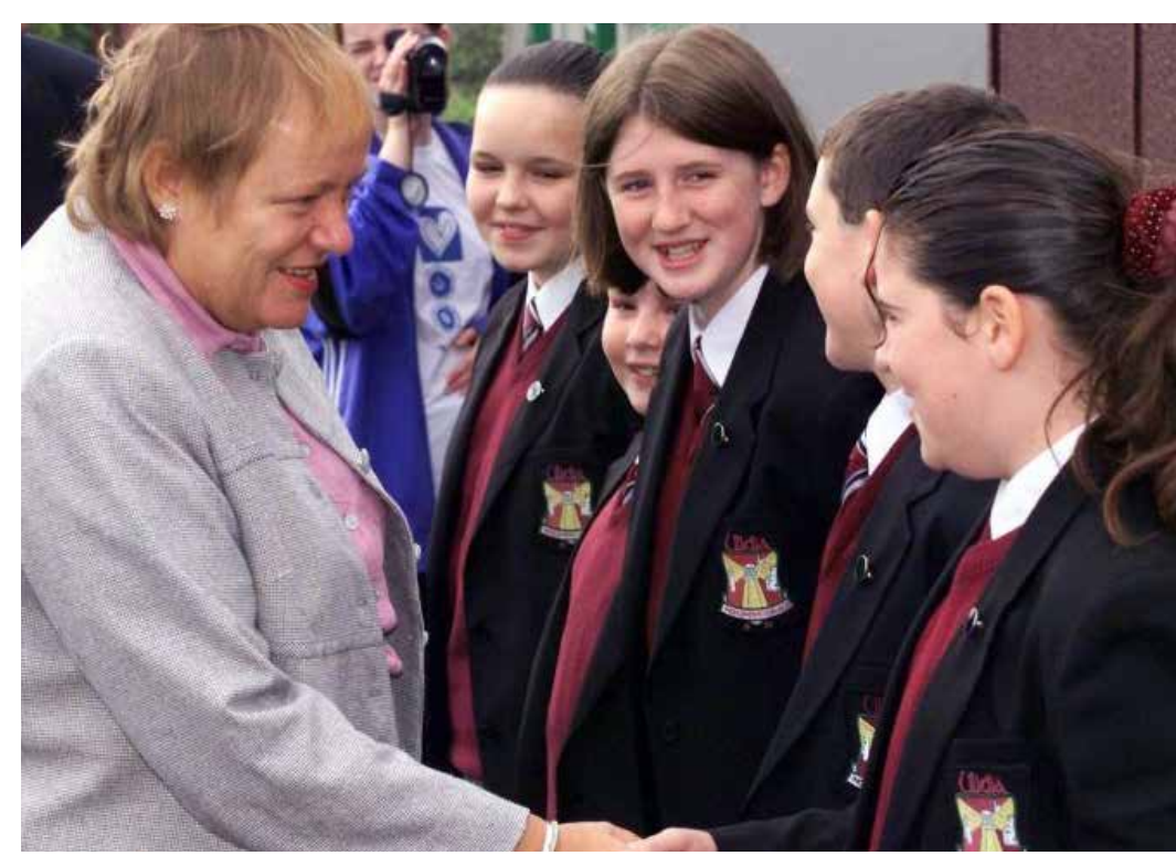
The then new Secretary of State, Dr Mo Molum visits Ulidia at the opening in Whitehead