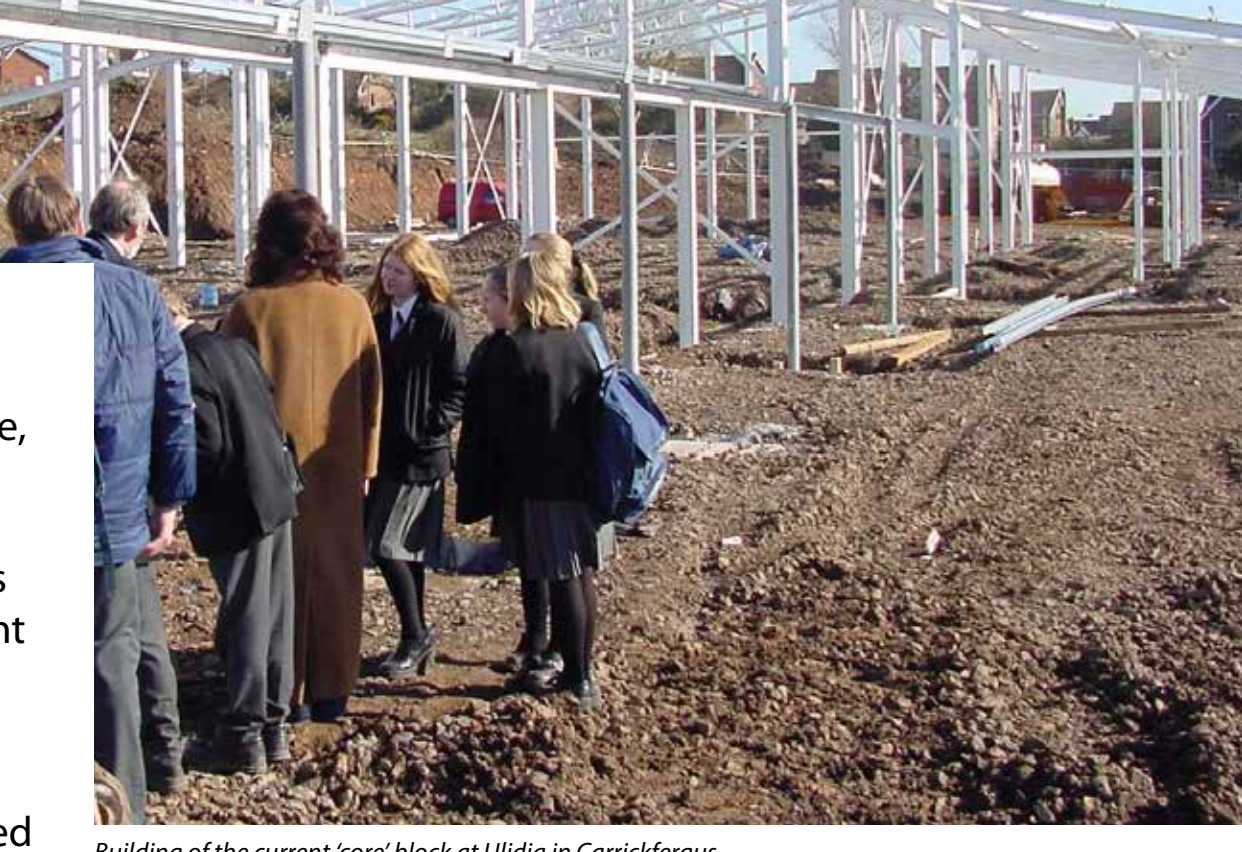
Building of the current 'core' block at Ulidia in Carrickfergus

During its time in the wilderness as an independently funded college Ulidia had to suffer three petrol bomb attacks and numerous sectarian incidents directed toward the students. It also experienced two arson attacks, once of which destroyed our library.