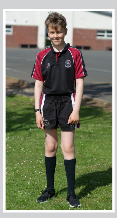
Either narrow or wide UIC approved black tracksuit bottoms are acceptable (Kukri). UIC approved Shorts are optional.