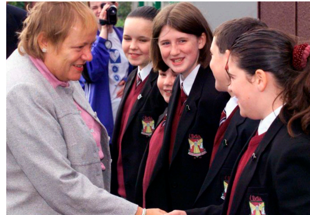
The then new Secretary of State, Dr Mo Molum visits Ulidia at the opening in Whitehead