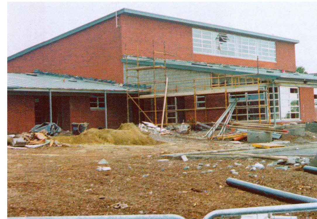
Building of the current 'core' block at Ulidia in Carrickfergus

During its time in the wilderness as an independently funded college Ulidia had to suffer three petrol bomb attacks and numerous sectarian incidents directed toward the students. It also experienced two arson attacks, once of which destroyed our library.