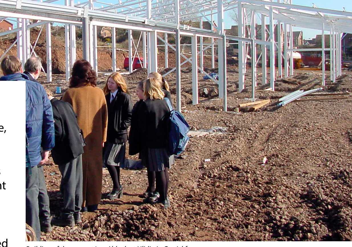
Building of the current 'core' block at Ulidia in Carrickfergus

During its time in the wilderness as an independently funded college Ulidia had to suffer three petrol bomb attacks and numerous sectarian incidents directed toward the students. It also experienced two arson attacks, once of which destroyed our library.