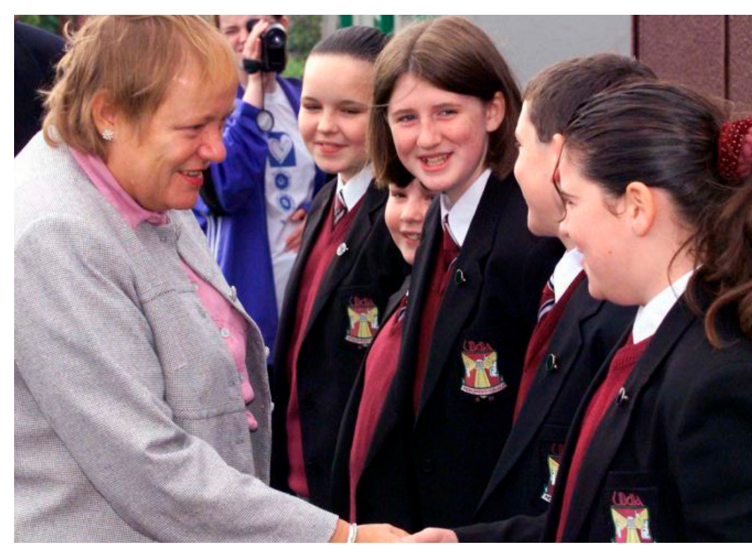
The then new Secretary of State, Dr Mo Molum visits Ulidia at the opening in Whitehead