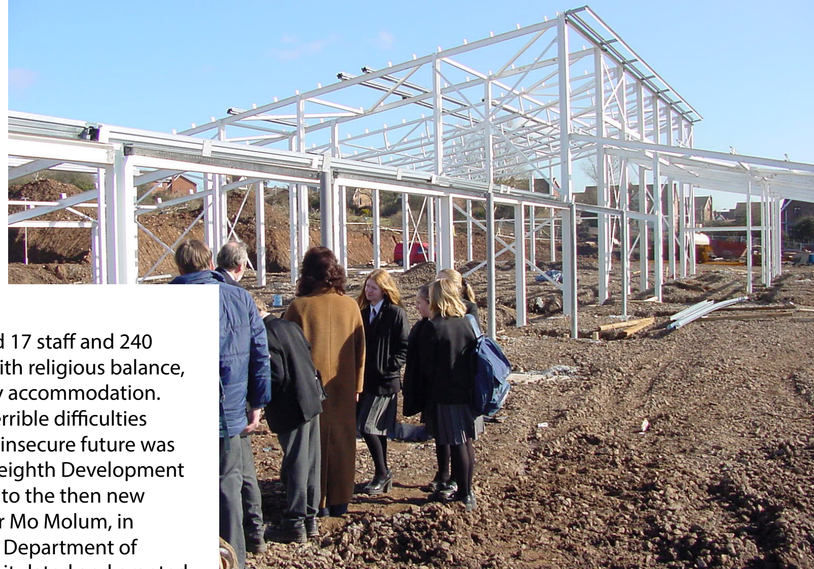
Building of the current 'core' block at Ulidia in Carrickfergus

During its time in the wilderness as an independently funded college Ulidia had to suffer three petrol bomb attacks and numerous sectarian incidents directed toward the students. It also experienced two arson attacks, once of which destroyed our library.