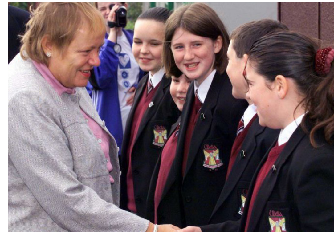
The then new Secretary of State, Dr Mo Molum visits Ulidia at the opening in Whitehead