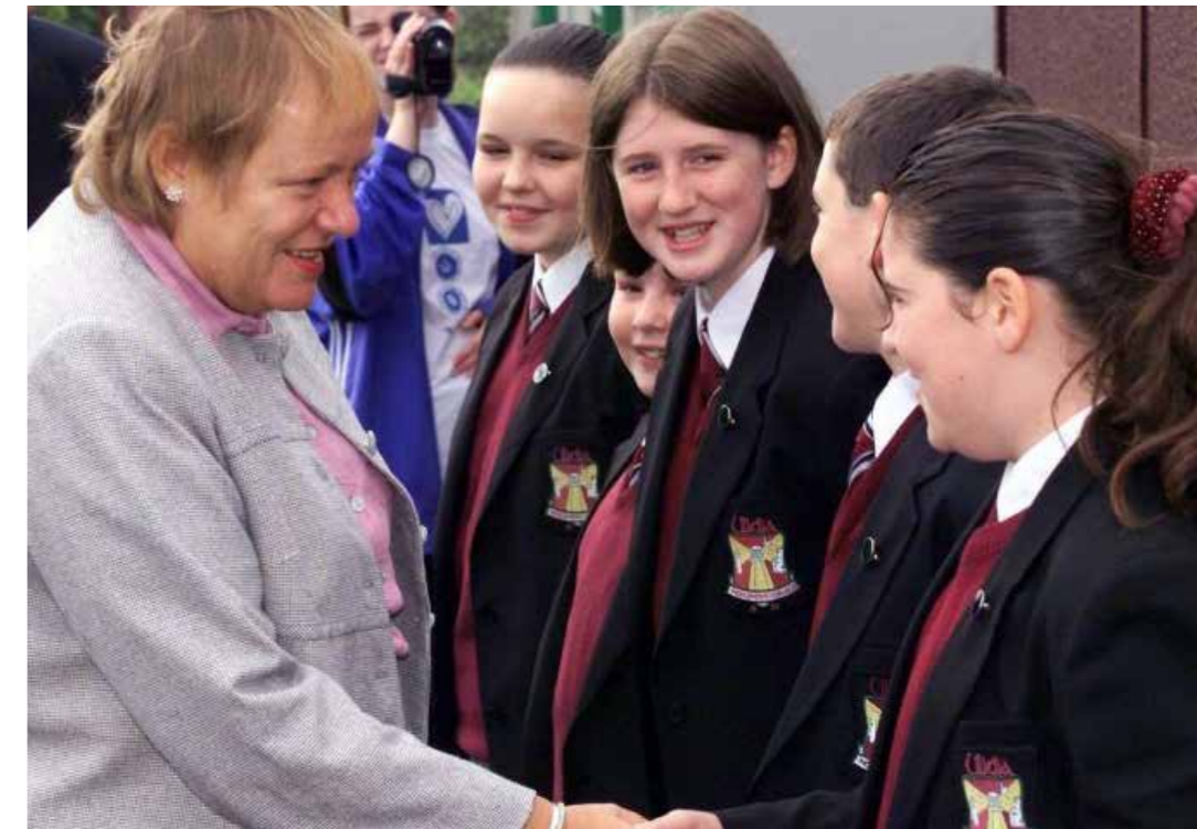
The then new Secretary of State, Dr Mo Molum visits Ulidia at the opening in Whitehead