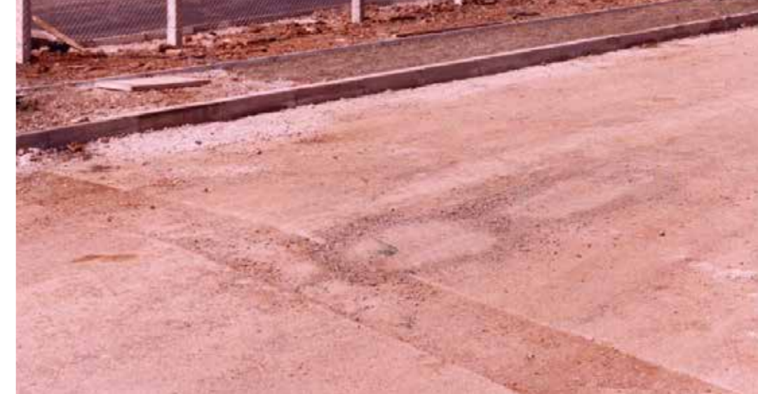
The College opened on a disused hockey pitch in Whitehead

Once again, the college approached the IEF for financial assistance for 1998/99 and once again our friends at both NICIE and the IEF pledged their support. Of course, money had to be found from somewhere! The college continued independently in 1998/99 with over 130 students and ten staff and, of course, more mobile accommodation. The religious balance was perfect and completely in line with government recommendations - yet the government of the day "was not convinced." The IEF continued to fund the college from their meagre resources and the high quality education that was promised to the students was delivered by the staff.