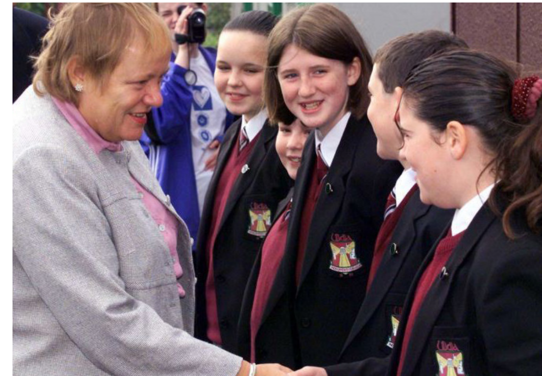
The then new Secretary of State, Dr Mo Molum visits Ulidia at the opening in Whitehead