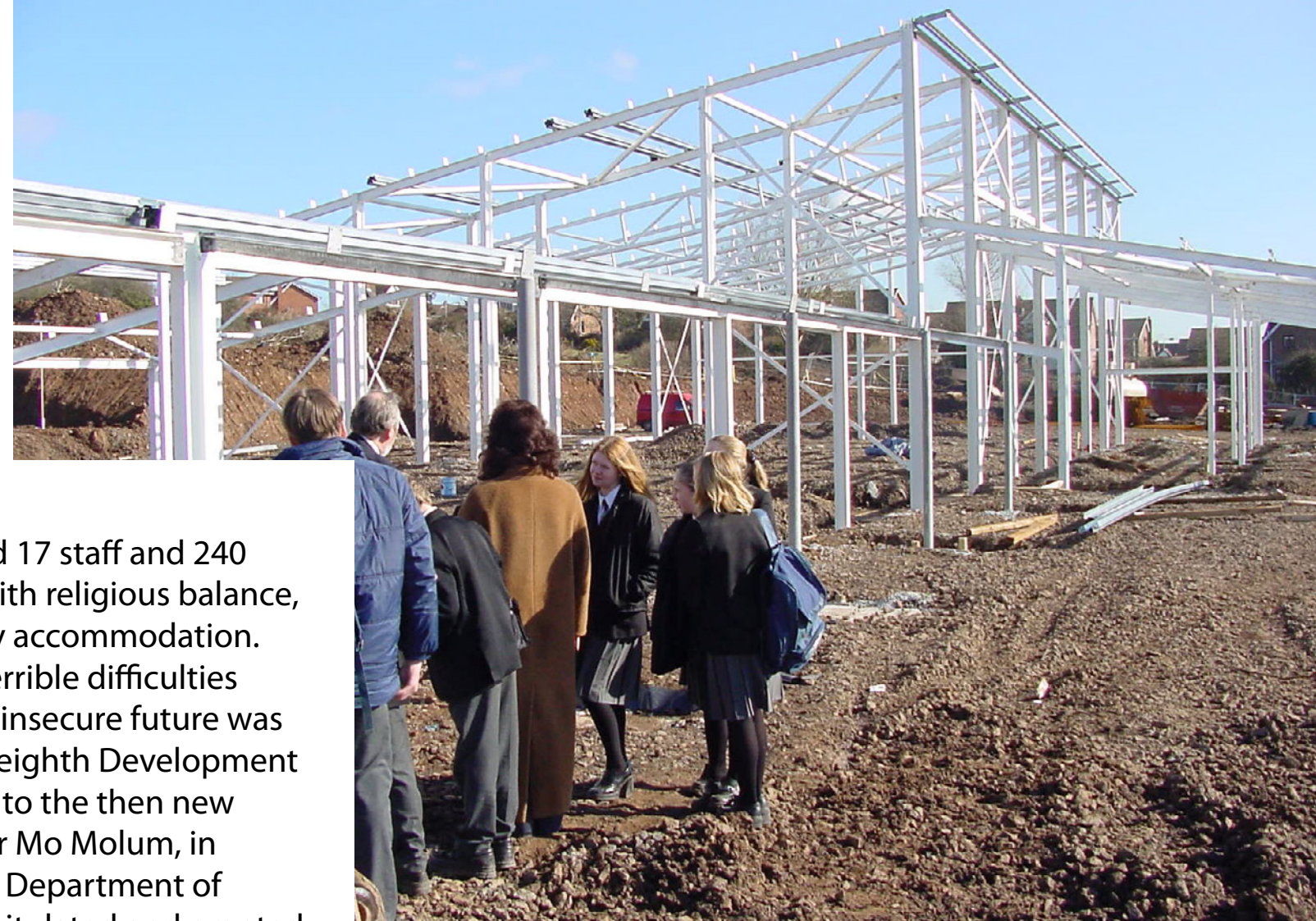
Building of the current 'core' block at Ulidia in Carrickfergus

During its time in the wilderness as an independently funded college Ulidia had to suffer three petrol bomb attacks and numerous sectarian incidents directed toward the students. It also experienced two arson attacks, once of which destroyed our library.