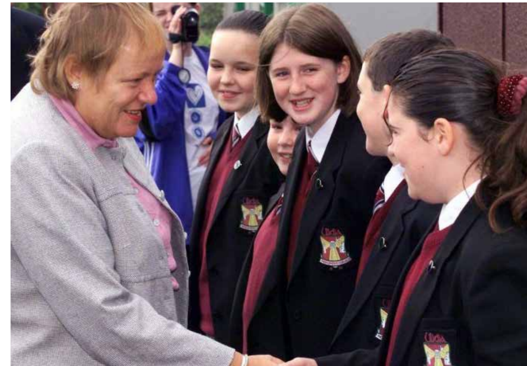
The then new Secretary of State, Dr Mo Molum visits Ulidia at the opening in Whitehead