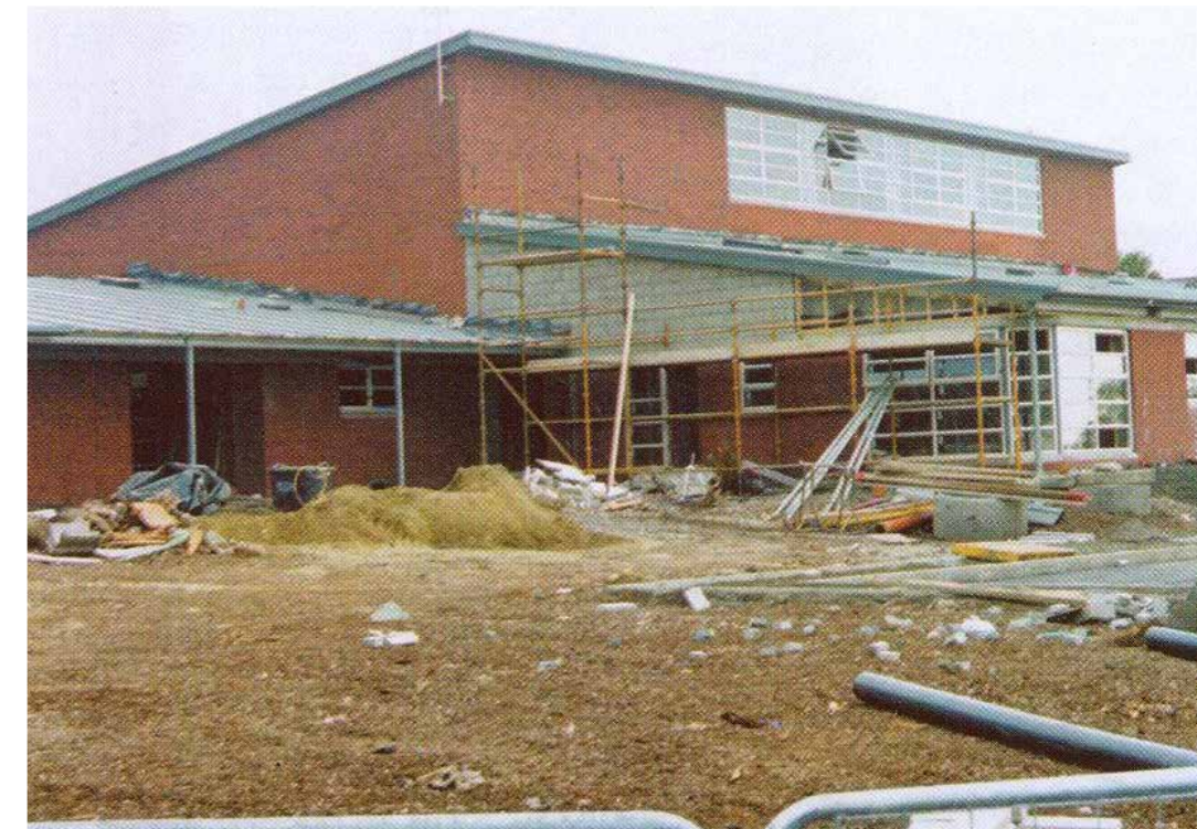
Building of the current 'core' block at Ulidia in Carrickfergus

During its time in the wilderness as an independently funded college Ulidia had to suffer three petrol bomb attacks and numerous sectarian incidents directed toward the students. It also experienced two arson attacks, once of which destroyed our library.