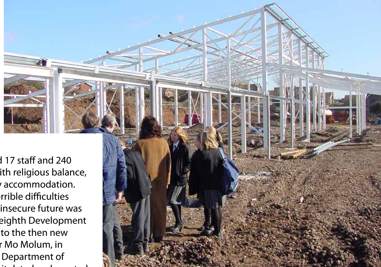
Building of the current 'core' block at Ulidia in Carrickfergus

During its time in the wilderness as an independently funded college Ulidia had to suffer three petrol bomb attacks and numerous sectarian incidents directed toward the students. It also experienced two arson attacks, once of which destroyed our library.