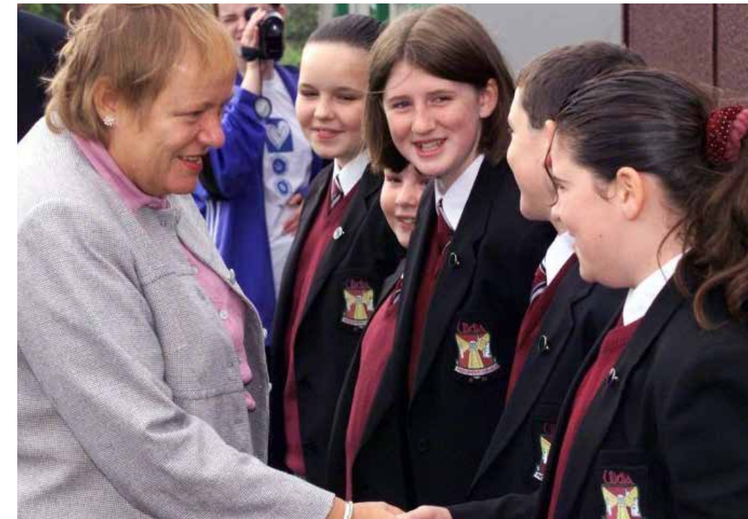
The then new Secretary of State, Dr Mo Molum visits Ulidia at the opening in Whitehead