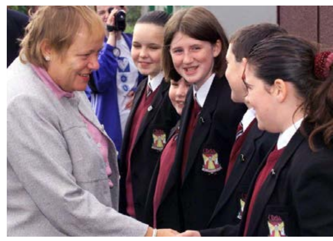
The then new Secretary of State, Dr Mo Molum visits Ulidia at the opening in Whitehead