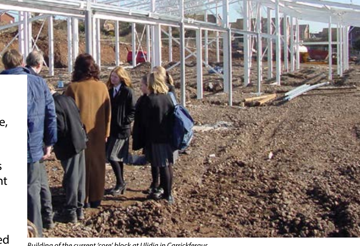
Building of the current 'core' block at Ulidia in Carrickfergus

During its time in the wilderness as an independently funded college Ulidia had to suffer three petrol bomb attacks and numerous sectarian incidents directed toward the students. It also experienced two arson attacks, once of which destroyed our library.