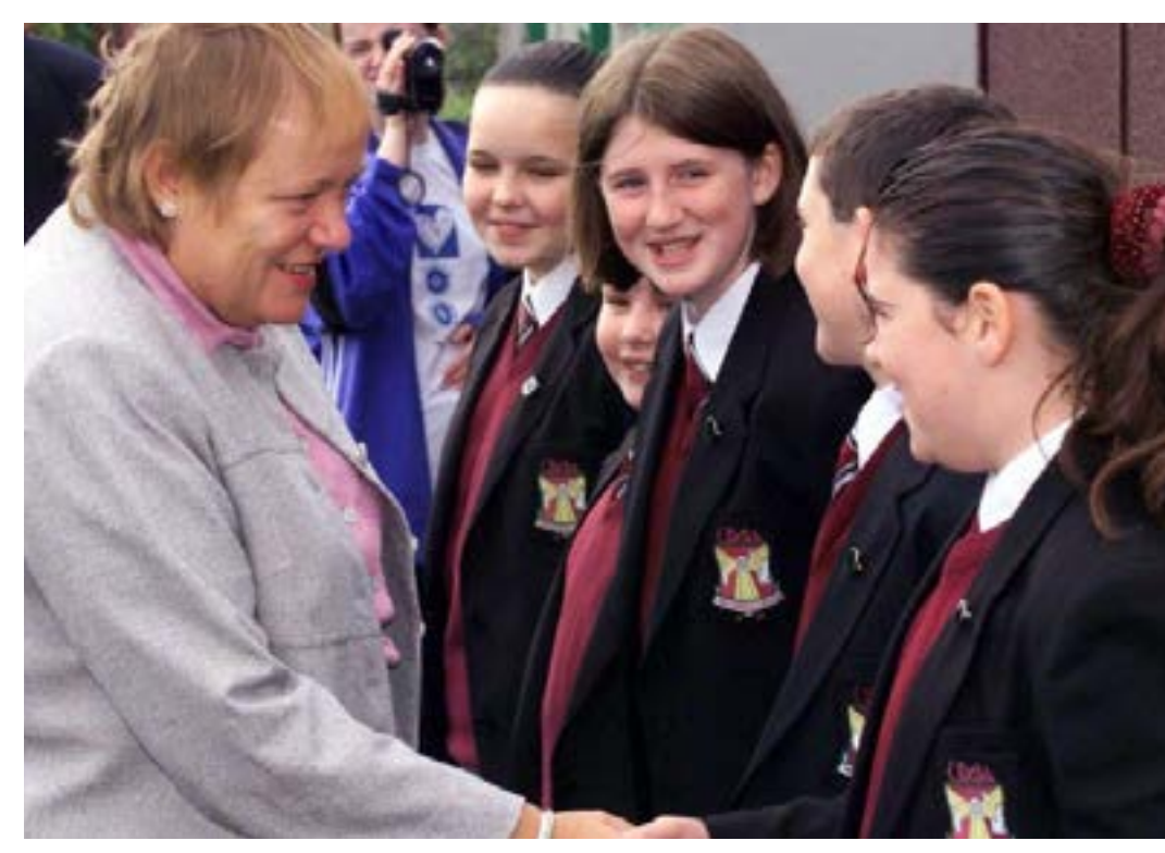
The then new Secretary of State, Dr Mo Molum visits Ulidia at the opening in Whitehead