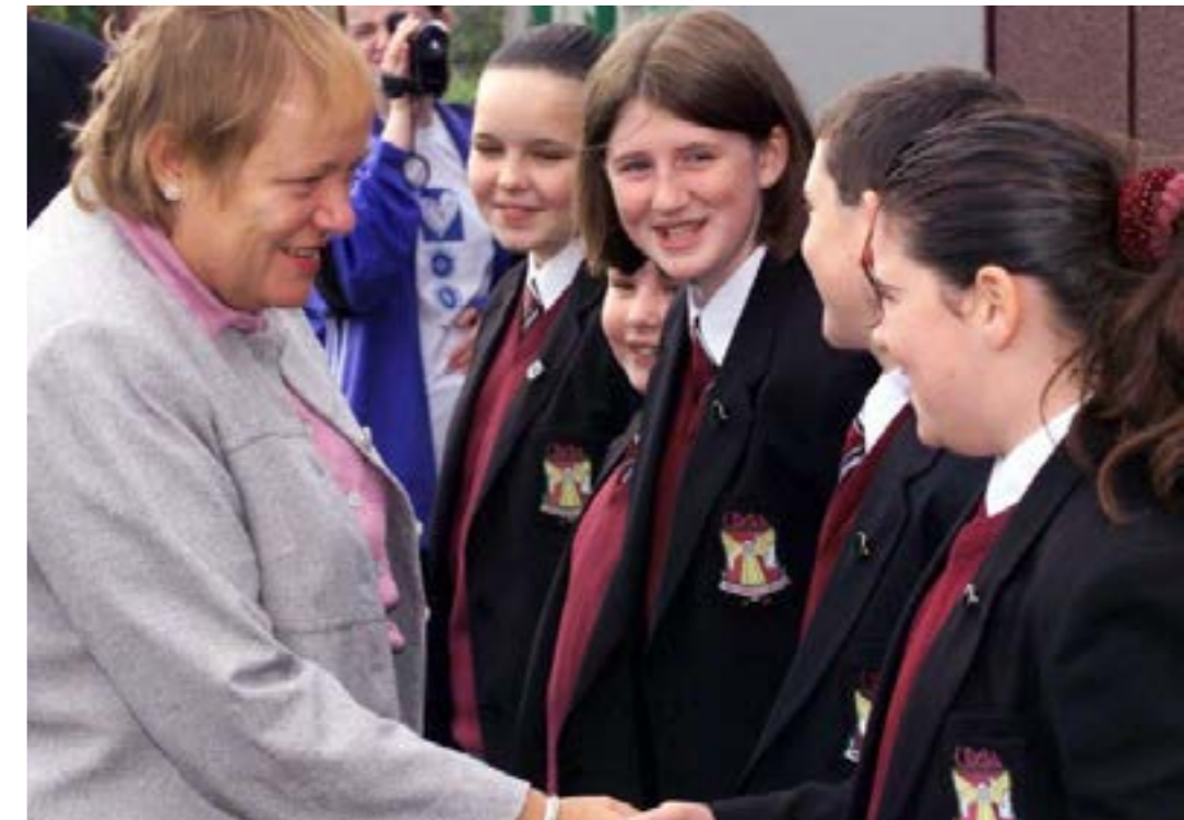
The then new Secretary of State, Dr Mo Molum visits Ulidia at the opening in Whitehead