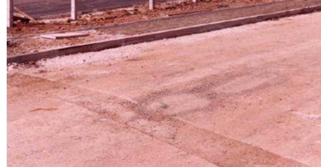
The College opened on a disused hockey pitch in Whitehead

Once again, the college approached the IEF for financial assistance for 1998/99 and once again our friends at both NICIE and the IEF pledged their support. Of course, money had to be found from somewhere! The college continued independently in 1998/99 with over 130 students and ten staff and, of course, more mobile accommodation. The religious balance was perfect and completely in line with government recommendations - yet the government of the day "was not convinced." The IEF continued to fund the college from their meagre resources and the high quality education that was promised to the students was delivered by the staff.