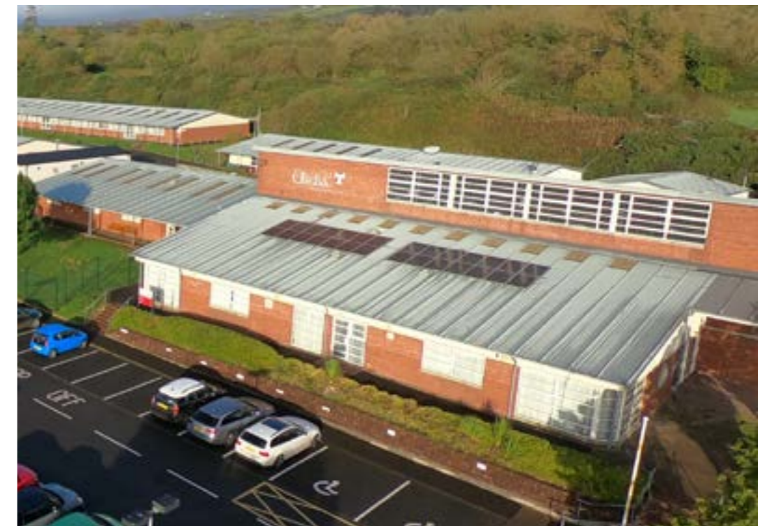
Building of the current 'core' block at Ulidia in Carrickfergus

During its time in the wilderness as an independently funded college Ulidia had to suffer three petrol bomb attacks and numerous sectarian incidents directed toward the students. It also experienced two arson attacks, once of which destroyed our library.