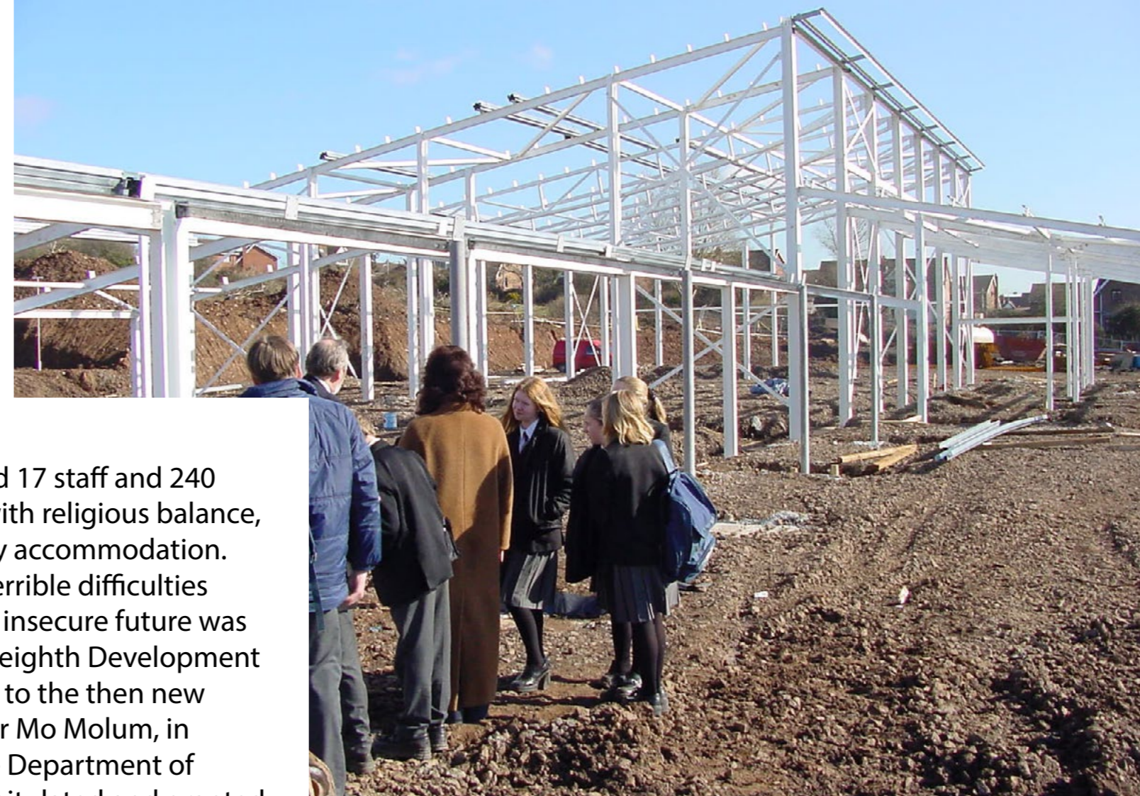
Building of the current 'core' block at Ulidia in Carrickfergus

The now customary Development Proposal was again presented to the Department of Education for the academic year 1999/2000. Given that the College had over 130 students with over 600 students on its waiting lists for the incoming years, everyone at the school was confident that this would be its year.