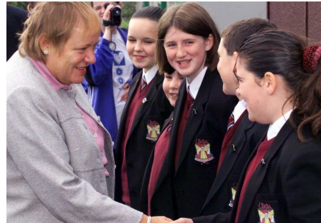
The then new Secretary of State, Dr Mo Molum visits Ulidia at the opening in Whitehead