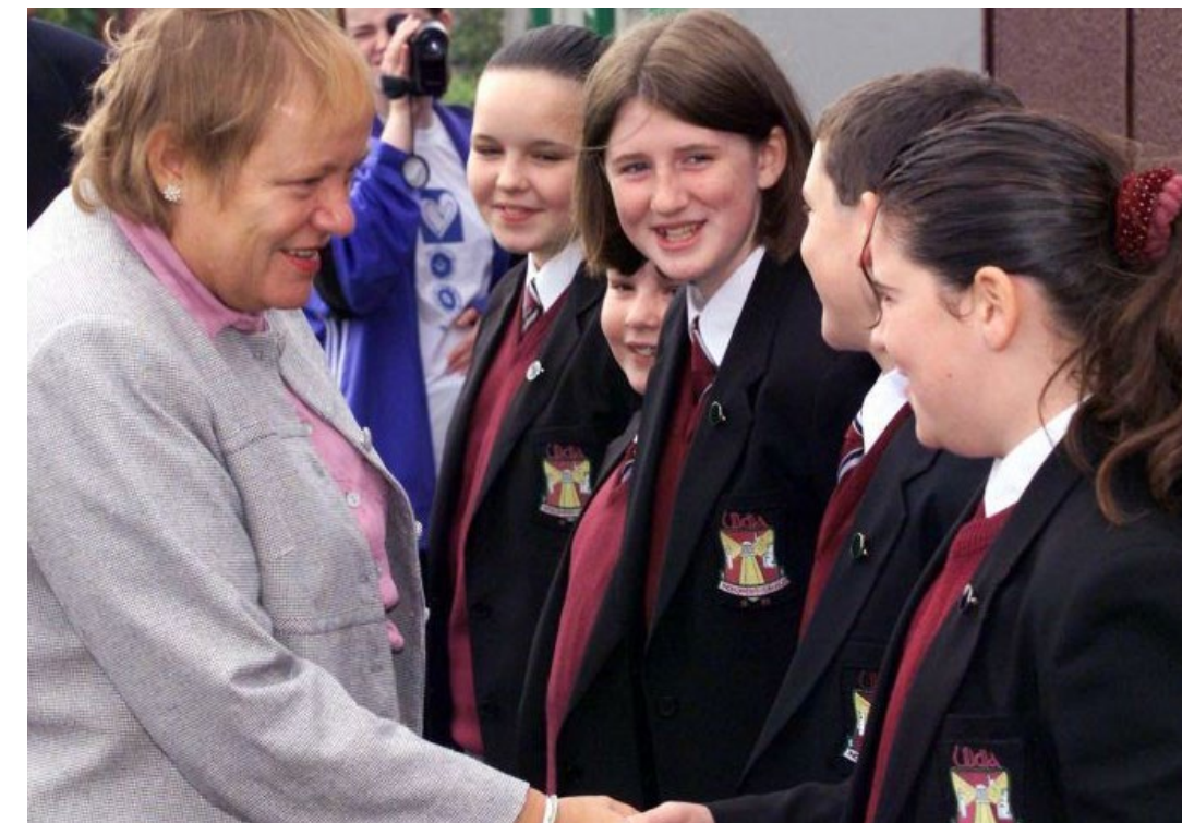
The then new Secretary of State, Dr Mo Molum visits Ulidia at the opening in Whitehead