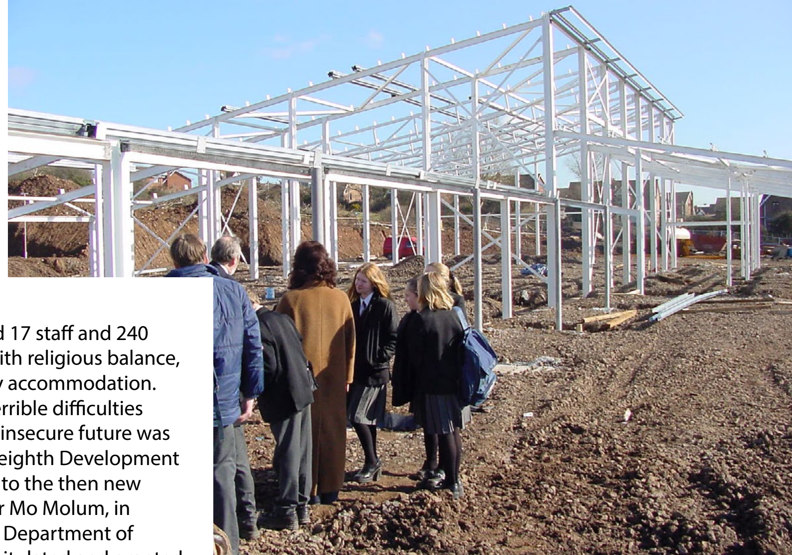
Building of the current 'core' block at Ulidia in Carrickfergus

During its time in the wilderness as an independently funded college Ulidia had to suffer three petrol bomb attacks and numerous sectarian incidents directed toward the students. It also experienced two arson attacks, once of which destroyed our library.