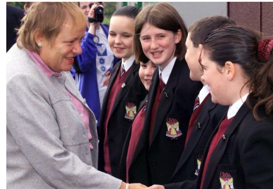
The then new Secretary of State, Dr Mo Molum visits Ulidia at the opening in Whitehead