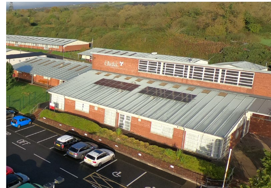
Building of the previous 'core' block at Ulidia in Carrickfergus

During its time in the wilderness as an independently funded college Ulidia had to suffer three petrol bomb attacks and numerous sectarian incidents directed toward the students. It also experienced two arson attacks, once of which destroyed our library.